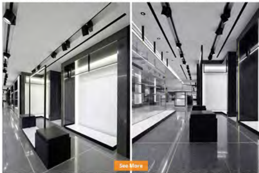
the work is defined by black and white photo

located in the sogo shopping center of hong kong, china utilizes the concept aligns with the defining characteristics of wang's works. the store, which opened in september 2014, implements a floating shelving unit, duratrans displays, minimalist furniture, terrazzo, white italian carrara, black nero marquina marble, and polished bronze metal. the contrasting color palette of black and white is complemented by a balance of transparency and opacity.