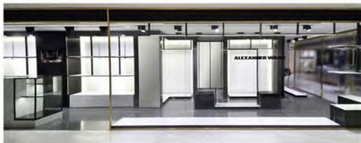
exterior view