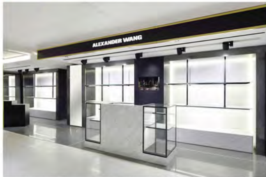
several of the platforms are constructed from italian carrara marble