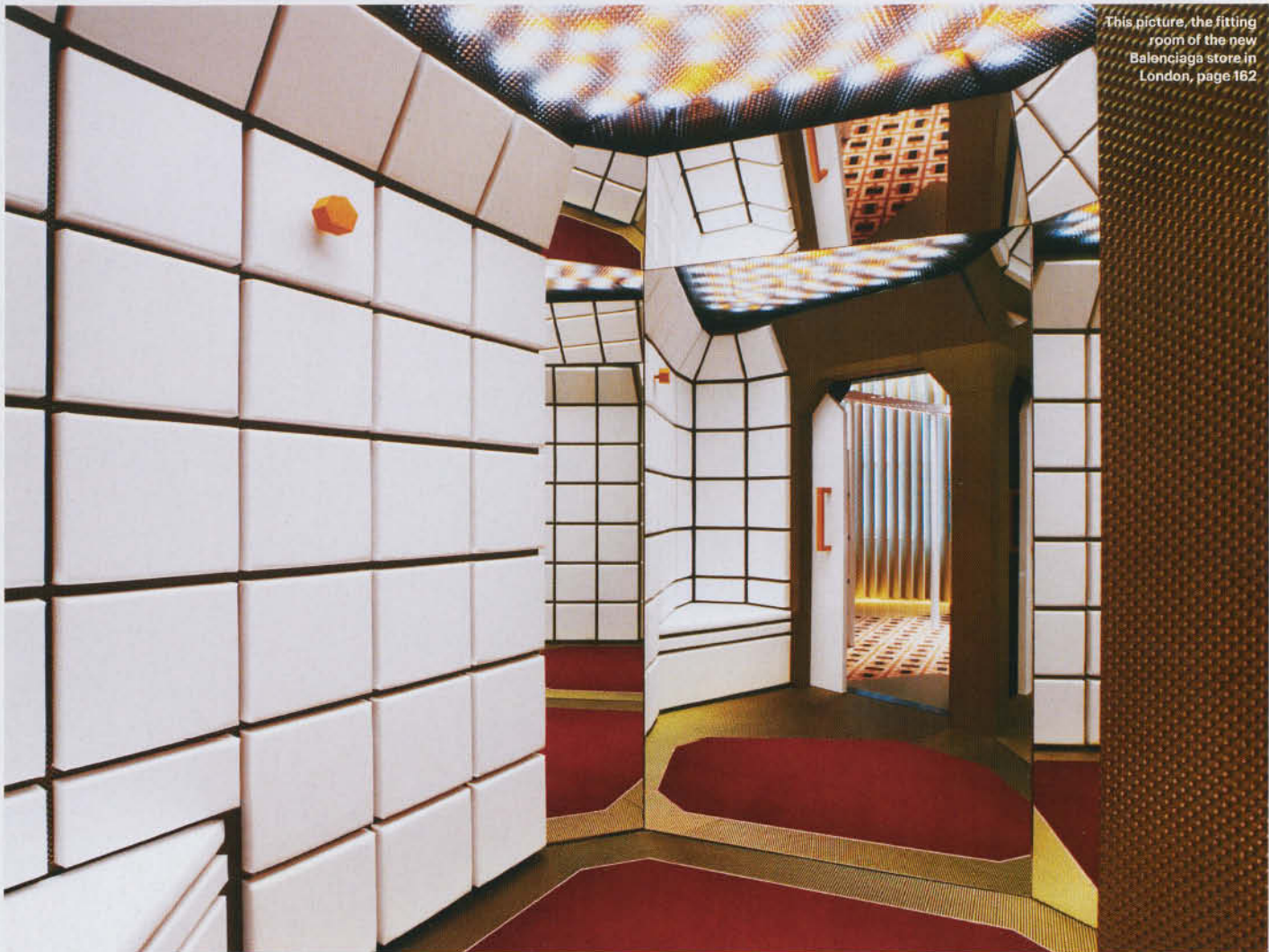
This picture, the fitting room of the new Balenciaga store in London, page 162